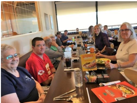
Wichita's Village Inn served the August lunch.