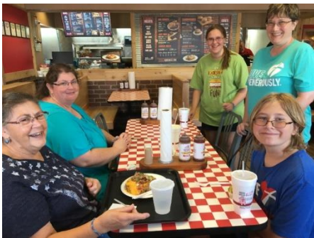
Hog Wild, Wichita hosted a July lunch.