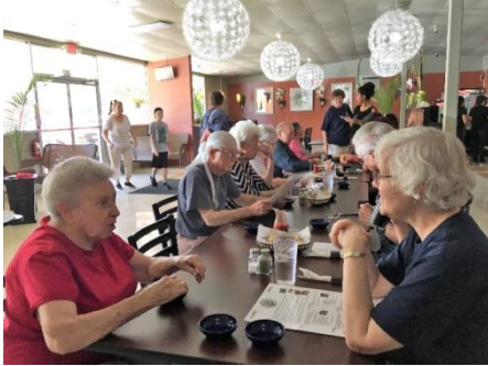
June Lunch at La Pacida, Haysville