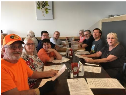
May lunch at Easy Egg, Haysville