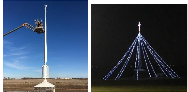
Giving Tree for Haysville Community Outreach